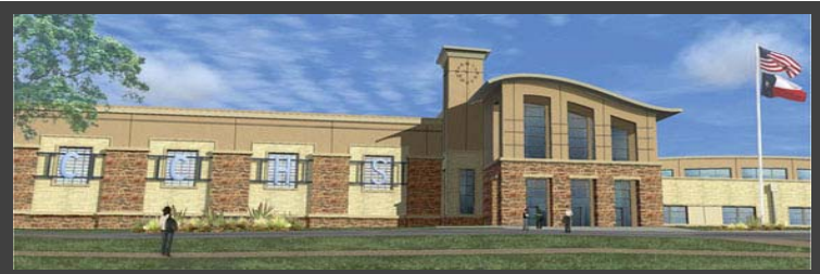
Artist rendition of completed new Cedar Creek High School for Bastrop ISD

KST looks forward to seeing the finished project and takes pride in knowing that all contributing employees have done their part building for a better tomorrow.